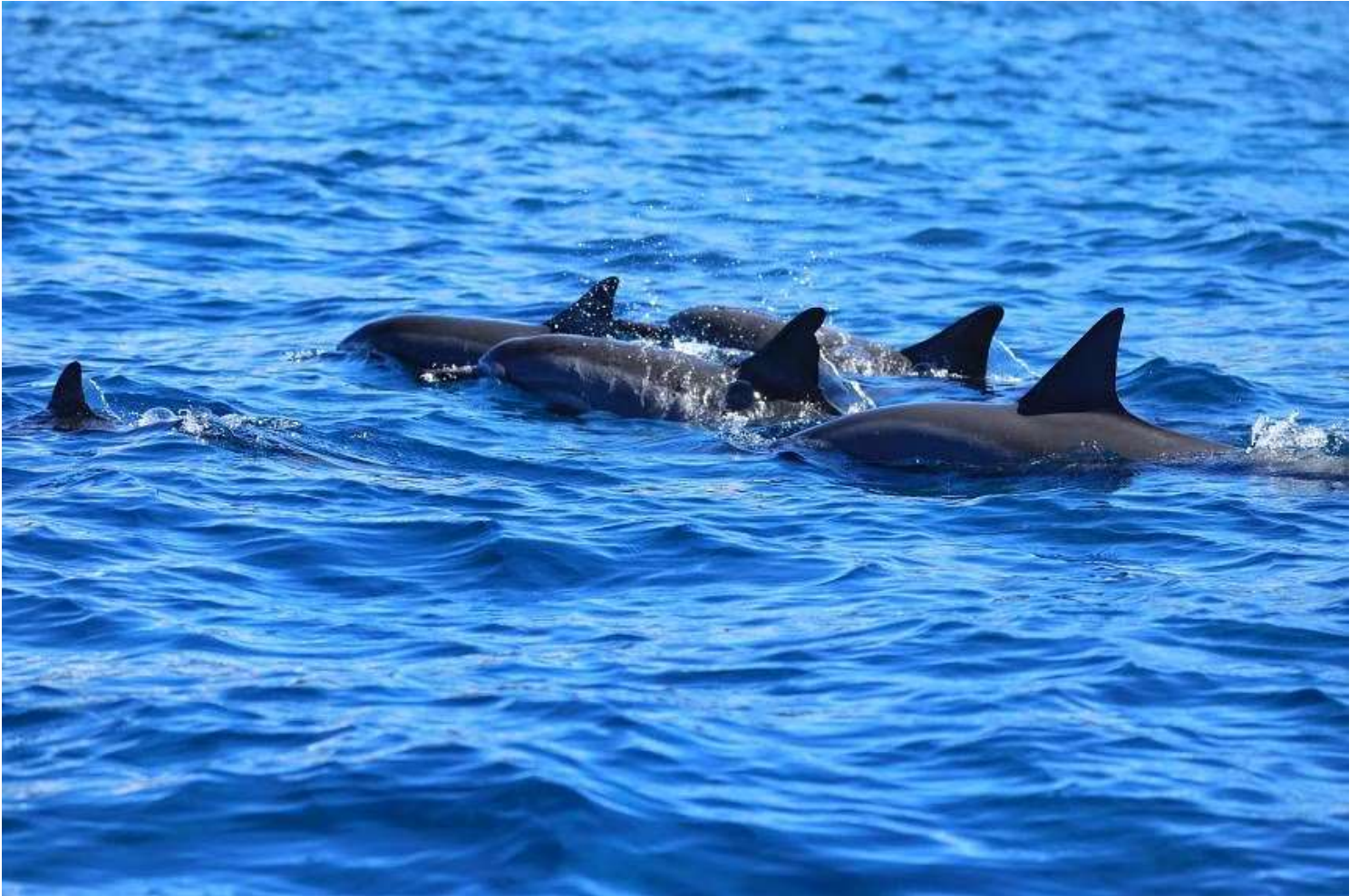
Spinner dolphin with different shaped dorsal fins. Dorsal fins are much like the dolphins' fingerprints.